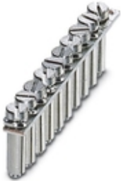
Fixed bridge, pitch: 5 mm, number of positions: 10, color: silver

Please be informed that the data shown in this PDF Document is generated from our Online Catalog. Please find the complete data in the user's documentation. Our General Terms of Use for Downloads are valid ( http://phoenixcontact.com/download )